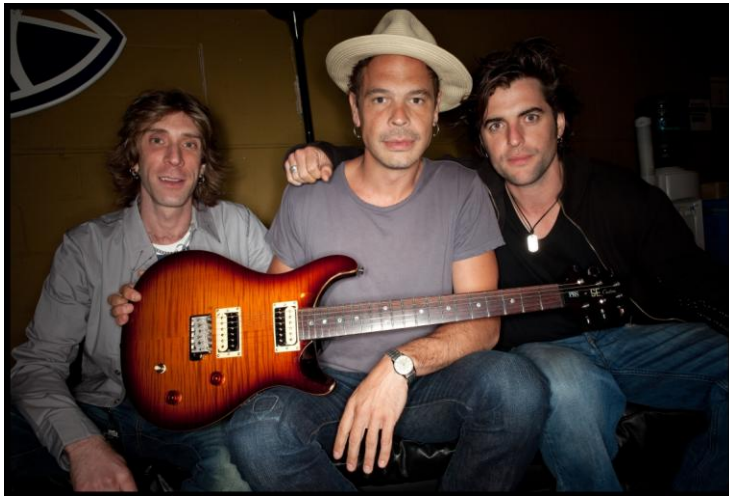
Some of the guys from Thornley pose with a PRS guitar inside the Backstage Artist Lounge on June 27 th , 2009