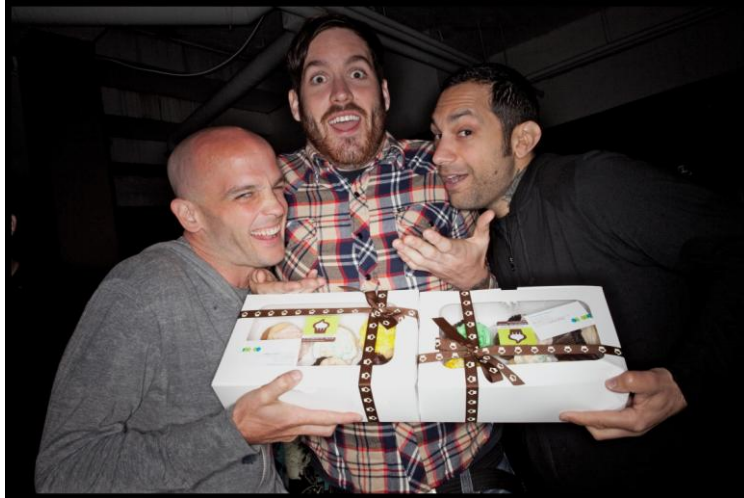
Some of the guys from Rise Against pose with cupcakes from The Cupcakery inside the Backstage Artist Lounge on June 27 th , 2009