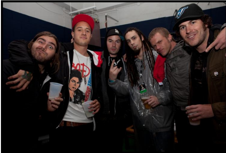
Various band members get together to pose for a group shot inside the Backstage Artist Lounge on June 27 th , 2009